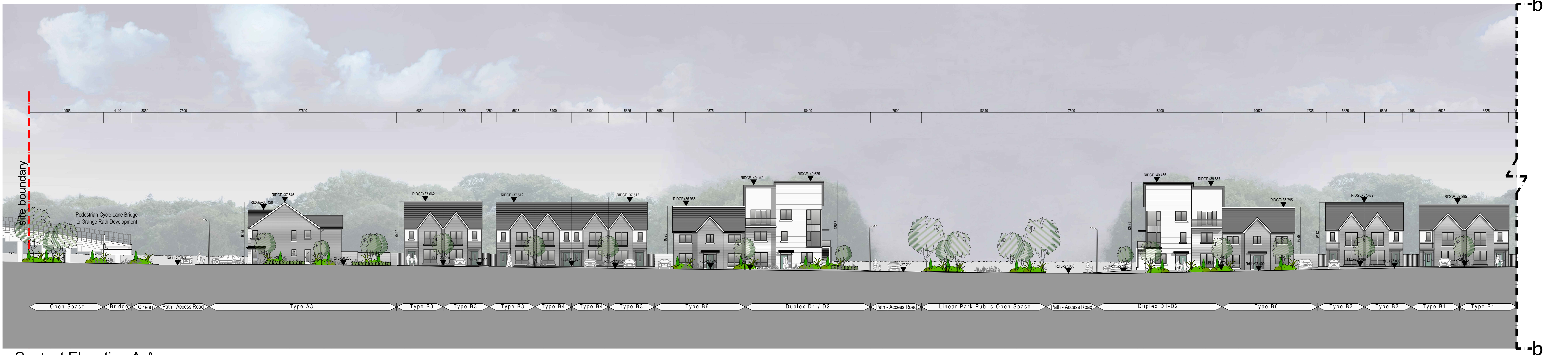
Context Elevation A-A Scale 1:200