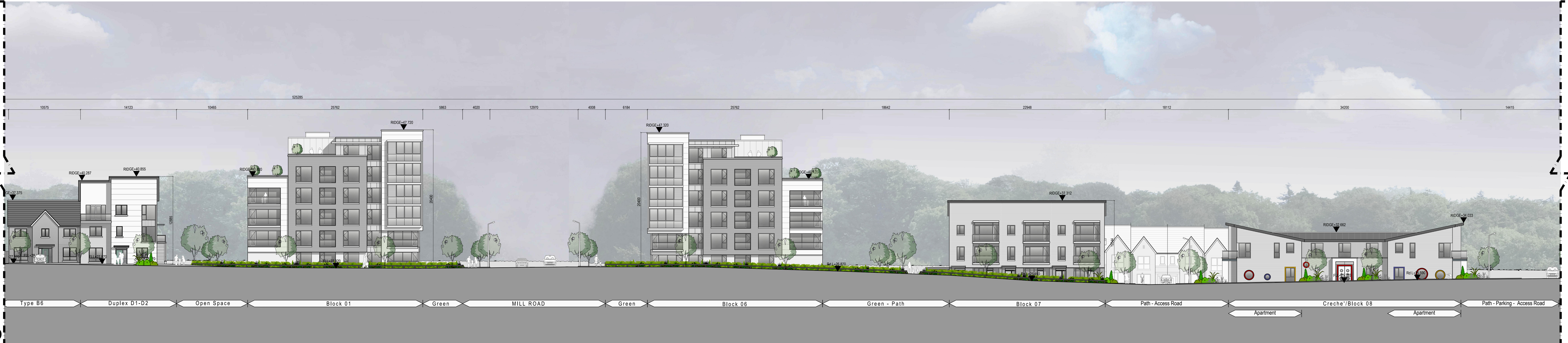
Context Elevation B-B Scale 1:200