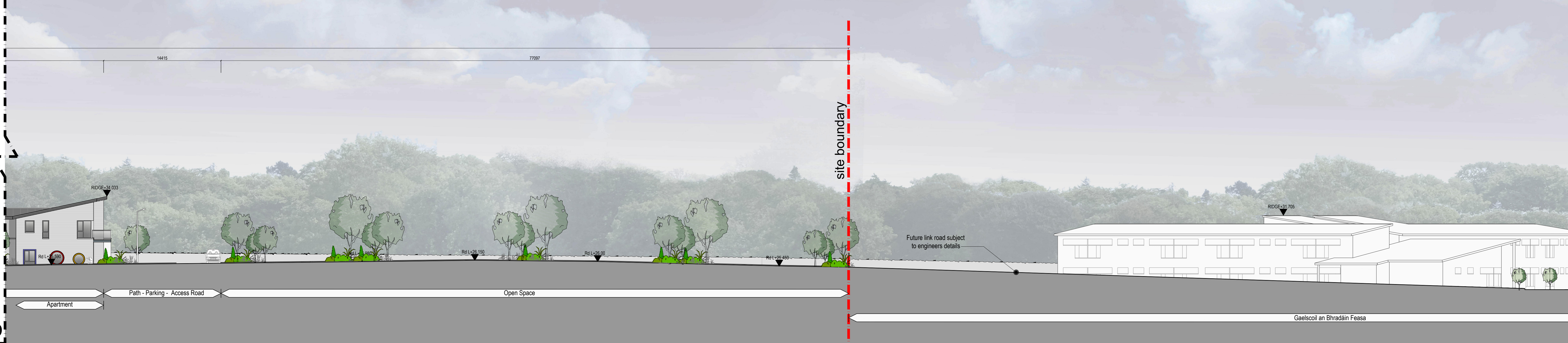
Context Elevation B-B Scale 1:200